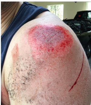
Shirts or Skins?